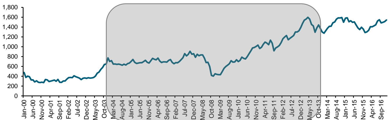
Exhibit 3: SET index during VAYU1 in December 2003-November 2013