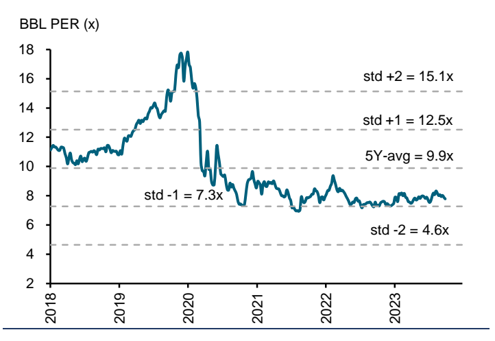
Exhibit 5: One-year forward rolling PER