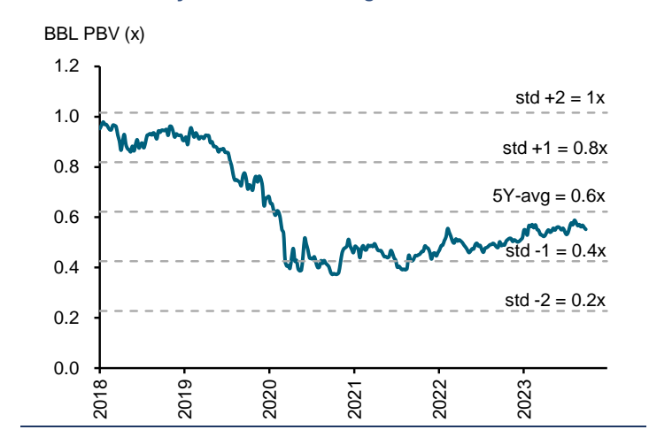
Exhibit 4: One-year forward rolling P/BV