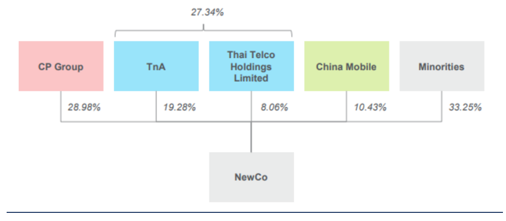
Exhibit 1: Shareholding structure for Mergerco