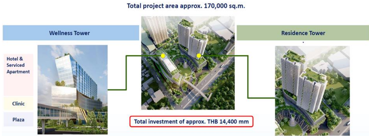
Exhibit 1: Project details