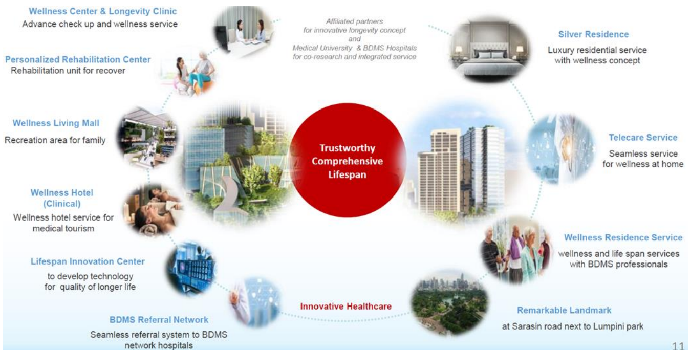
Exhibit 4: Concept and service offerings