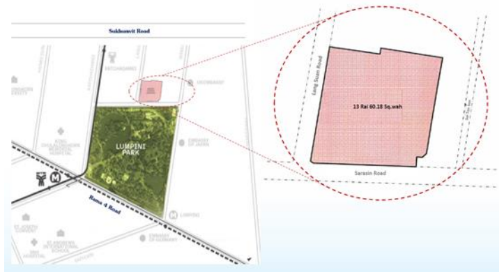
Exhibit 3: Project location

Sources: BDMS; Global Wellness Institute, 2020