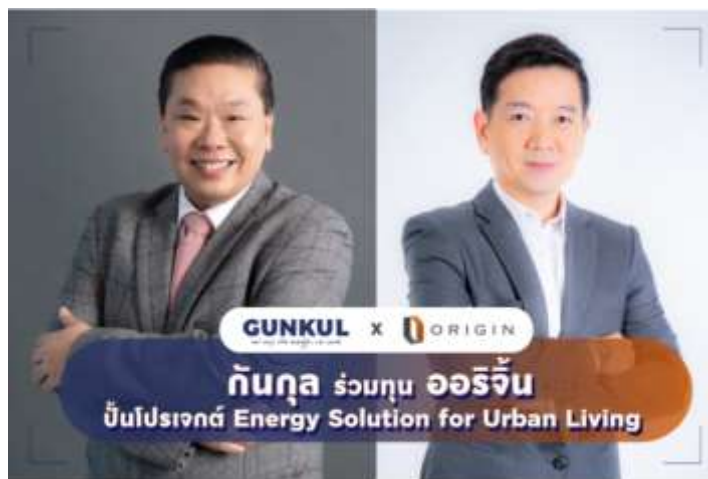
Exhibit 3: Management of GUNKUL (left) and ORI (right)