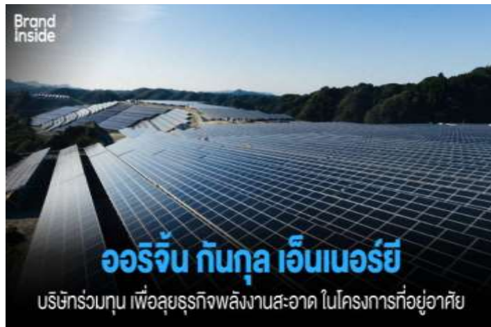
Exhibit 1: Solar farm business is one of GUNKUL's core power businesses