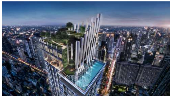
Exhibit 6: ORI's luxury condominium project – Park Origin Ratchathevi