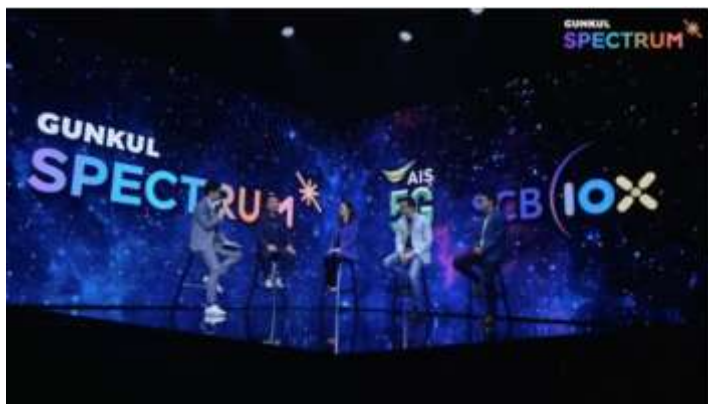
Exhibit 5: GUNKUL Spectrum is a cooperative endeavour between GUNKUL and SCB10x