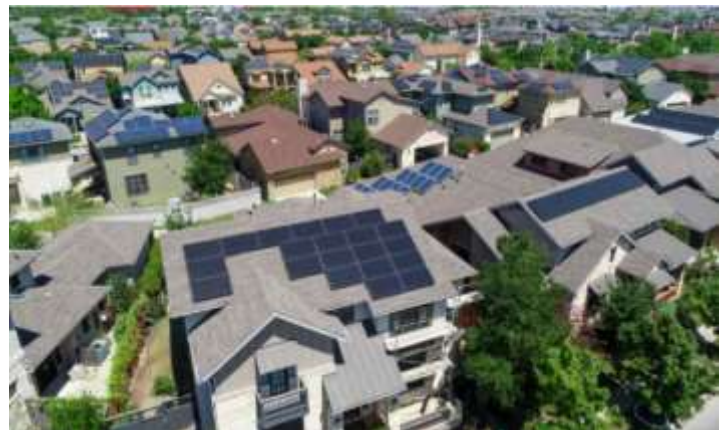
Exhibit 4: 'GUNKUL Spectrum' is GUNKUL's arm for its solar rooftop business