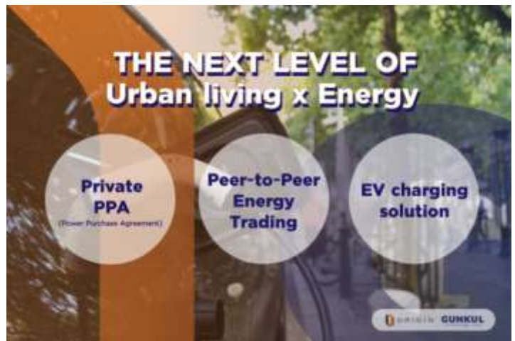
Exhibit 2: Business structure