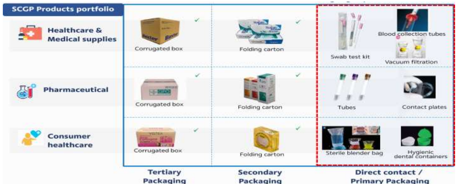
Exhibit 2: SCGP's product portfolio