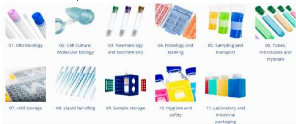
Exhibit 3: Deltalab's products