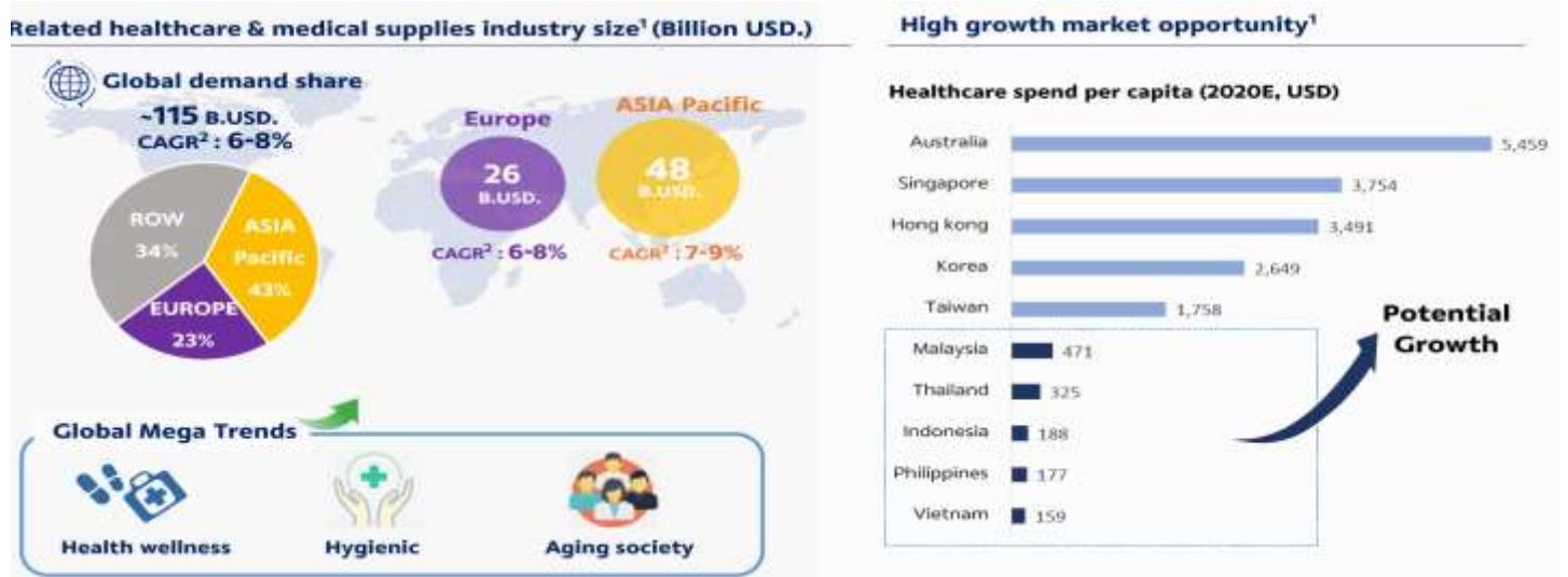
Exhibit 1: Deltalab's market opportunity