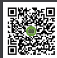
The Manual for Using Application IR PLUS AGM